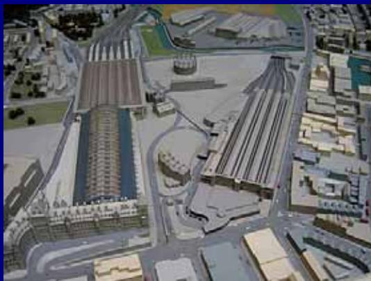
Model showing the redevelopment of the King's Cross area of London and the new terminal for the Channel Tunnel Rail Link

Up to 23,000 people who live there will be immediately affected by the redevelopment including disruption in their access to existing services and noise from construction work. The area has a history of redevelopment occurring without community engagement.