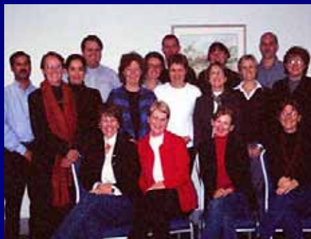
The 2004 Developmental Sites

If you'd like to find out more about being a developmental site please contact the CHETRE HIA Project team on (02) 9385 0420. Take a look at the HIA Connect website to find out more about what's involved in being a developmental site: http://chetre.med.unsw.edu.au/hia